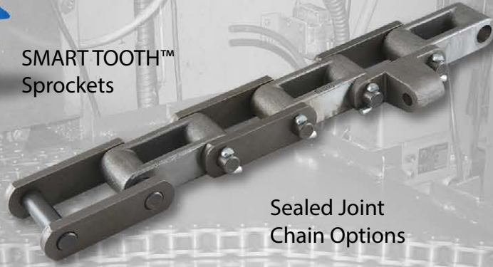
Sealed Joint Chain Options