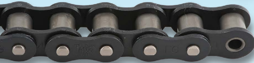
Lube-Free Lambda® Chain