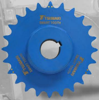
SMART TOOTH™ Sprockets