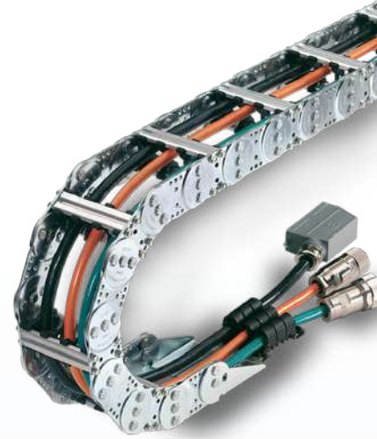
Steel Cable Carriers