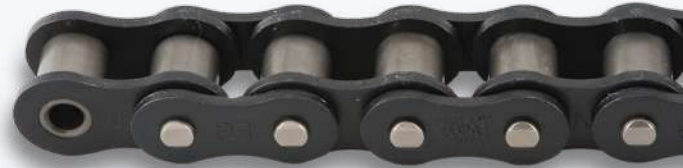
Lube-Free Lambda® Chain