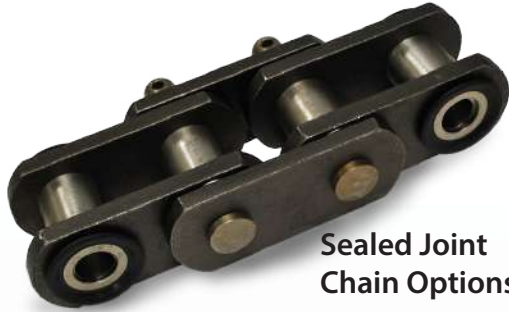
Sealed Joint Chain Options