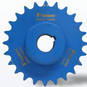
SMART TOOTH™ Sprockets