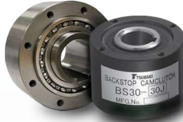
Backstops & Overrunning Clutches