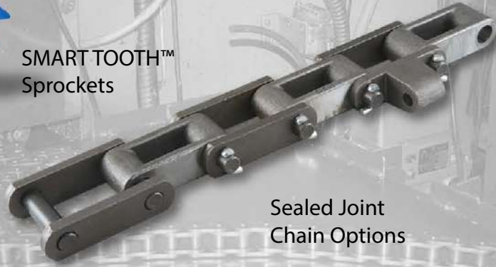
Sealed Joint Chain Options