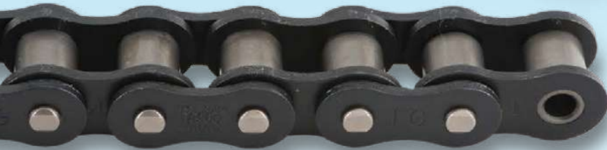
Lube-Free Lambda® Chain