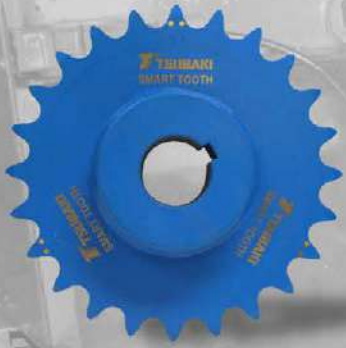
SMART TOOTH™ Sprockets